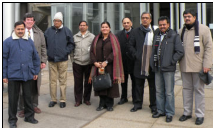
As part of a three-day briefing, a delegation from Bhopal, India toured several PPP projects in Washington, DC (seen here at the New York Avenue Metro station).

The II continues its work with a number of international agencies, including, the InterAmerican Development Bank, the International Monetary Fund, the United National Economic Commission for Europe and the World Bank. Of particular note is the on-going working relationship with Toyo University in Tokyo, Japan. In addition to providing briefings in Washington, DC for delegations of Toyo University students and government officials, NCPPP provides speakers and faculty for a number of University meetings and graduate courses.