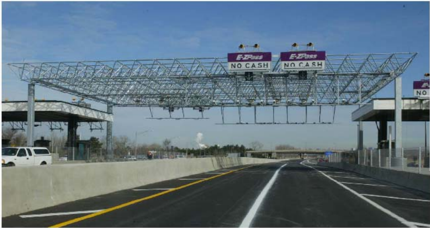
Exit 18W Toll Plaza New Jersey Turnpike