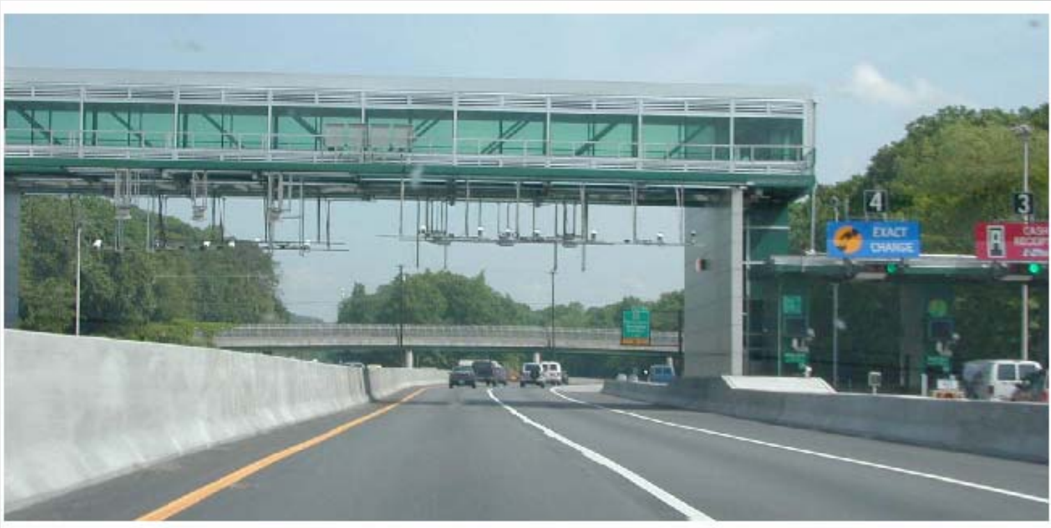
Pascack Valley Toll Plaza Garden State Parkway, NJ