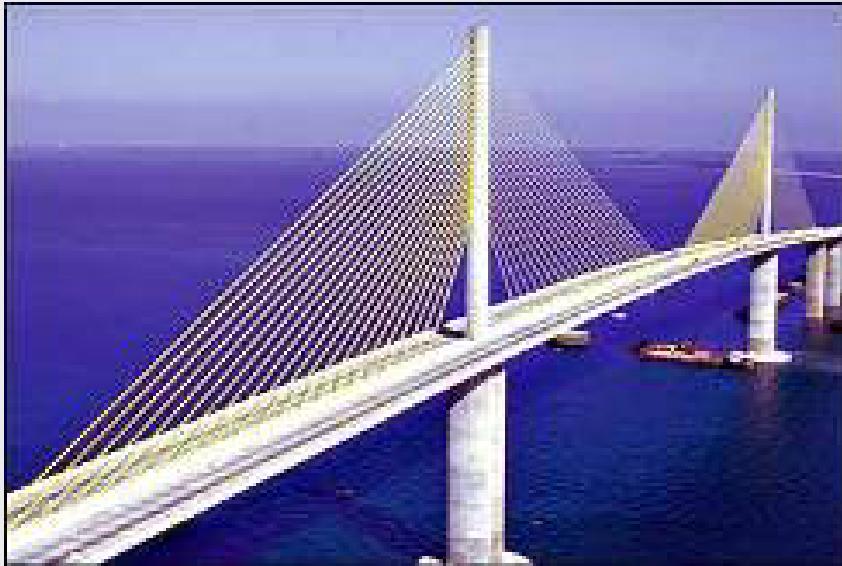
Sunshine Skyway Bridge Tampa Florida