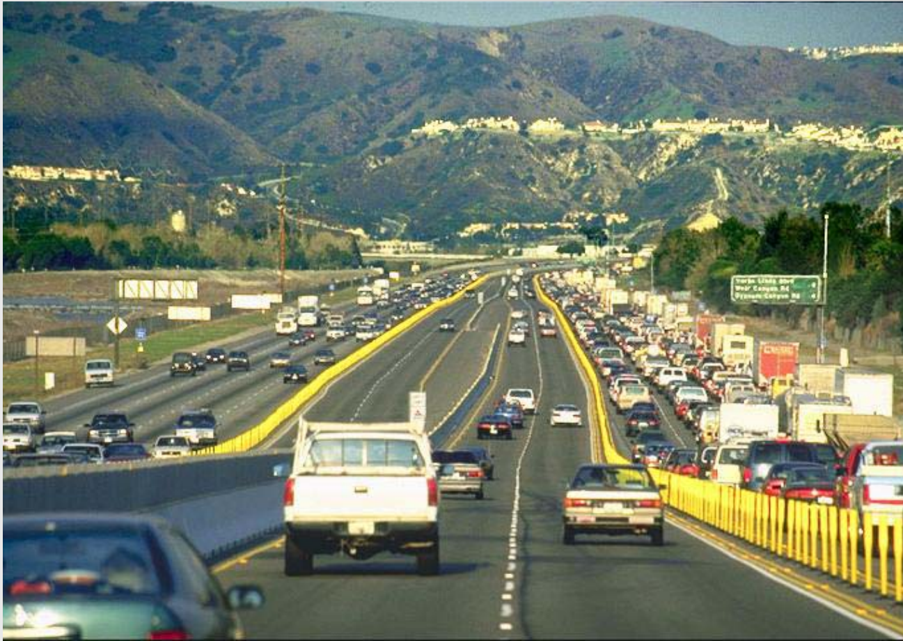
SR 91 Managed Lanes Free-Flow / Barrier Separation