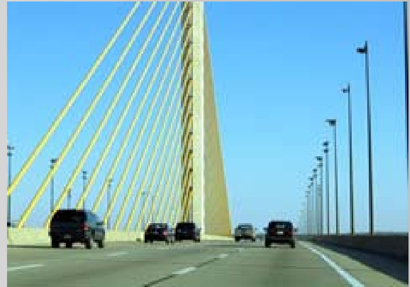
C&D Canal Bridge St. Georges Delaware