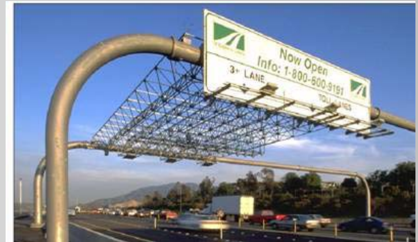
SR 91 - Overhead Gantry