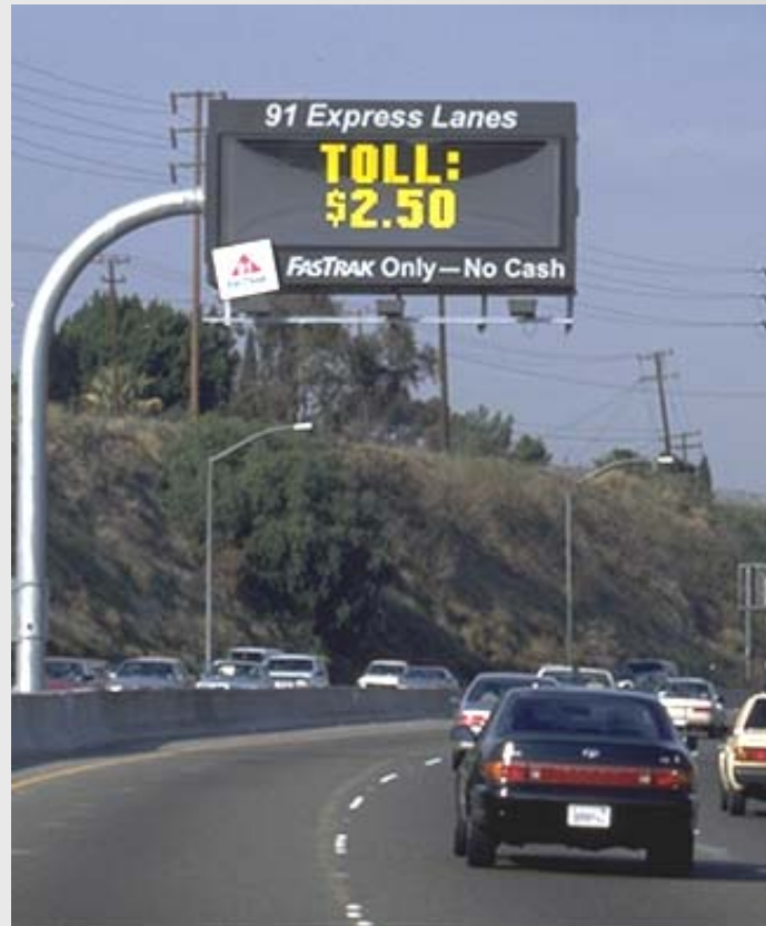
SR 91 - Variable Toll Rate Sign